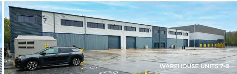
WAREHOUSE UNITS 7-9