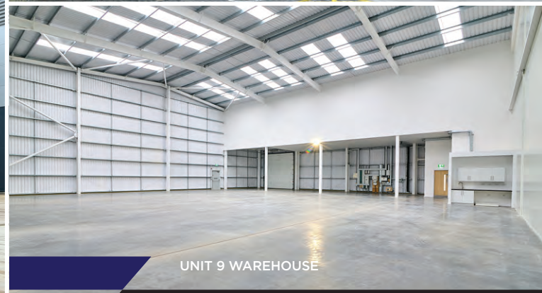
UNIT 9 WAREHOUSE