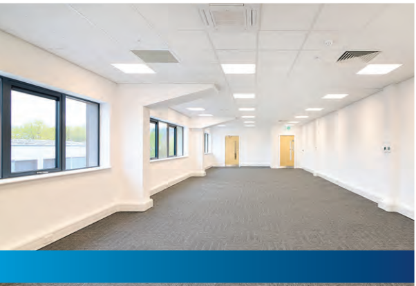
UNIT 9 FITTED OFFICE