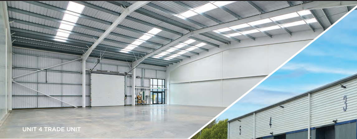
UNIT 4 TRADE UNIT