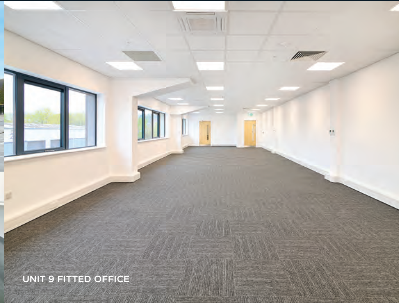
UNIT 9 FITTED OFFICE